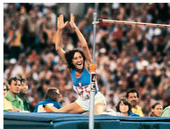
Sara Simeoni in a famous picture among athletics fans

Sara Simeoni, the tallest woman at Prague 1978. In a year when the first test-tube baby, Louise Brown, was born and women achieved more respect and freedom, Sara Simeoni, was the biggest star in the Prague championships. The Italian high jumper won with an incredible 2.01m jump, the same result with which the Easter German jumper Rosemarie Ackerman had beaten the world record at Brescia 1977.